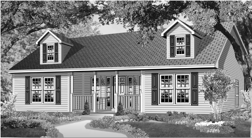
Exteriors depicted may be shown with optional features and site attachments done on site by others.